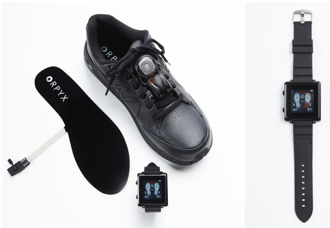
Figure 1. The SurroSense Rx Smart Insole System

Specifically, a simulated decision tree economic model was built to explore the short- (Figure 2) and long-term (Figure 3) cost effectiveness of the adjunctive use of the SurroSense Rx device in comparison to SOC alone, in the prevention of DFUs with recent history of the same. Device efficacy was estimated using the results of a pilot cohort study that was conducted on patients of the defined demographic. In our analysis, SOC was defined using best practice strategies for the management of patients with a history of diabetic foot disease [21,22].